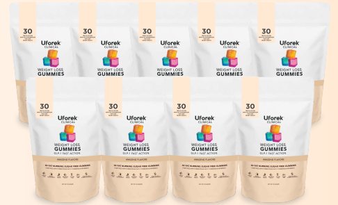
9 GLP-1 Gummy Bags or 9 GLP-1 Caramel Bags

UFOREK CLINICAL GLP-1 WEIGHT LOSS & CARDIOVASCULAR HEALTH NORMAL PRICE $450 SAVE 25% 3-MONTH PROGRAM $335