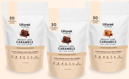
3 GLP-1 Gummy Bags or 3 GLP-1 Caramel Bags

UFOREK CLINICAL GLP-1 WEIGHT LOSS & CARDIOVASCULAR HEALTH 1-MONTH PROGRAM $150