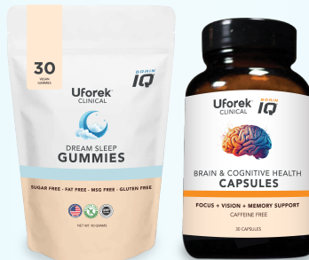
1 Dream Gummy Bag 1 Capsules

UFOREK CLINICAL RESTORATIVE SLEEP HEALTH 1-MONTH PROGRAM $70