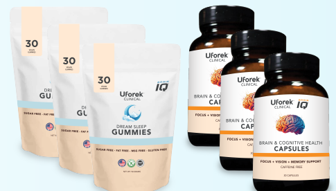
3 Dream Gummy Bags 3 Capsules

UFOREK CLINICAL RESTORATIVE SLEEP HEALTH NORMAL PRICE $180 SAVE 20% 3-MONTH PROGRAM $144