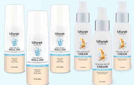
3 Roll-Ons 3 Cream Pumps

UFOREK CLINICAL PAIN AND INFLAMMATION RELIEF HEALTH NORMAL PRICE $390 SAVE 25% 3-MONTH PROGRAM $299