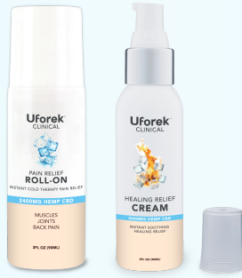
1 Roll-On 1 Cream Pump

UFOREK CLINICAL PAIN AND INFLAMMATION RELIEF HEALTH 1-MONTH PROGRAM $130